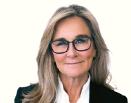
ANGELA AHRENDTS DBE SENIOR INDEPENDENT DIRECTOR, NON-EXECUTIVE DIRECTOR

Chairman, Heathrow Airport Holdings Limited; Chairman, XPlor Technologies; Trustee, Wellbeing of Women; Senior Advisor, Bain Capital.