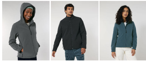
Stella Discoverer Stanley Navigator Stella Navigator

Shell : Balanced Plain weave , 6% Elastane , 94% Polyester - Recycled , Fluorine-free DWR , 342 GSM