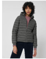
Stella Voyager Wool-Like

Shell : Plain Weave Brushed , 100% Polyester - Recycled , Fluorine-free DWR , 140 GSM