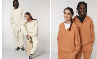
Decker Wave Terry Globetrotter Wave Terry