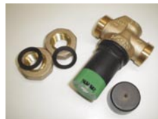
Pressure regulating valve (#MIXXPRV.1)