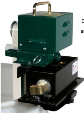
Belt Skimmer, Diverter™ and Lockjaw™ shown here