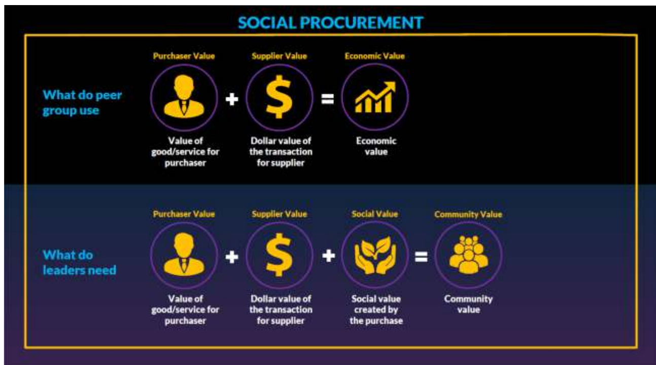
Figure 1: Social Procurement

Here are a few key pointers for Social Procurement: